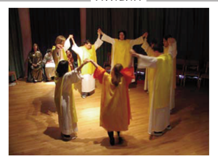
Festival at the Camphill-Rudolf Steiner-School, Aberdeen, Scotland