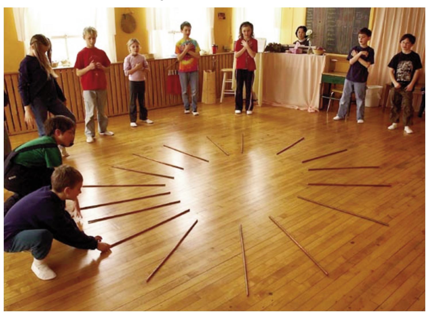
Children in eurythmy class create a "Sunburst" with copper rods, Cincinnati Waldorf School, Ohio